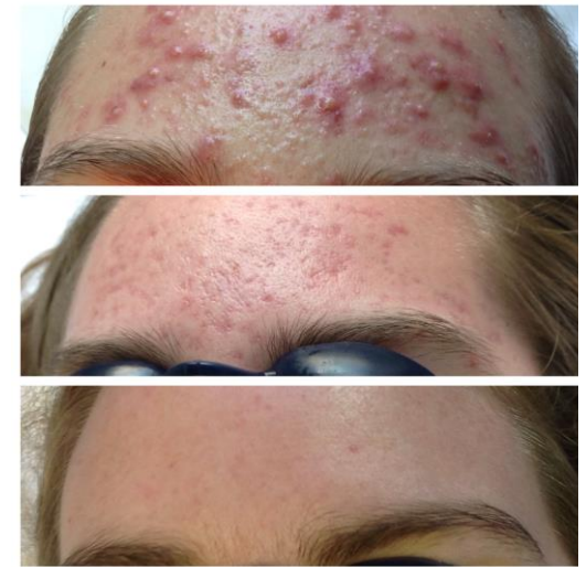
Acne Before, During and After our program